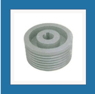
Compressor Flywheel Pulleys