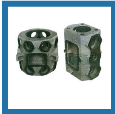
Khosla Kirloskar Cylinder