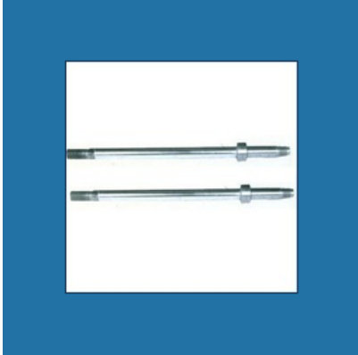
Air Compressor Piston Rods