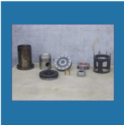
Compressor Parts PC-2