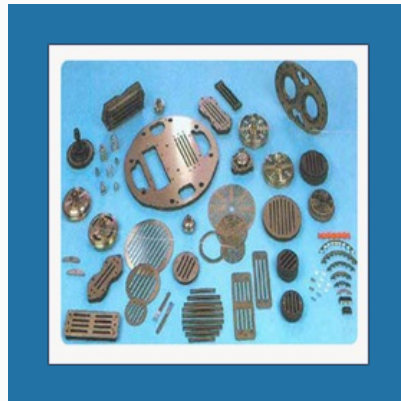
Compressor Discharge Valves