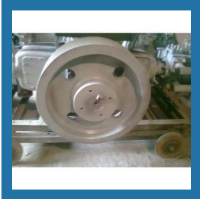
Khosla Kirloskar Flywheel