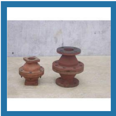
Non Return Valve Body