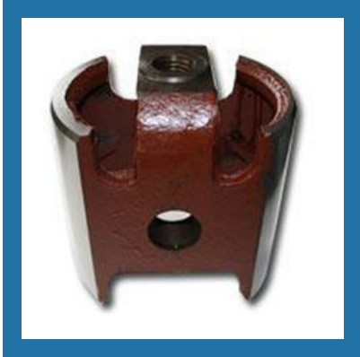
Khosla Kirloskar Cross Head