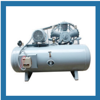
Air Compressors (Khosla Type)-3 to 10 HP