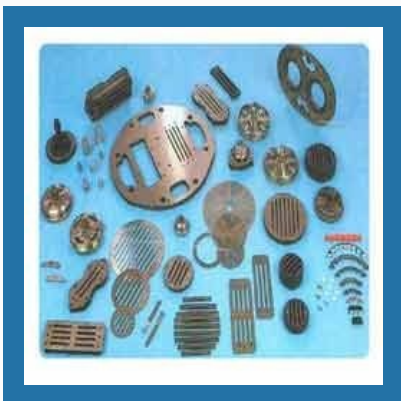
Khosla Kirloskar Suction