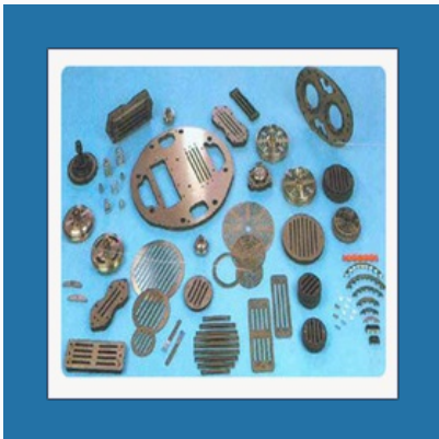
Compressor Suction Valves