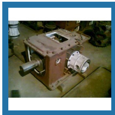
Khosla Kirloskar Crankcase Compressor