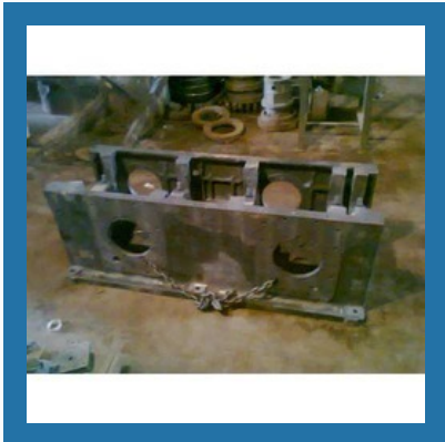
Khosla Kirloskar Crankcase