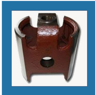
Cross Head Guides