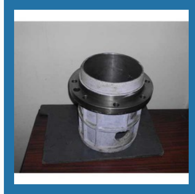
Khosla Kirloskar Cross Head Guides