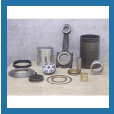
Refrigeration Compressors Parts for KC2 to KC6 & PC2