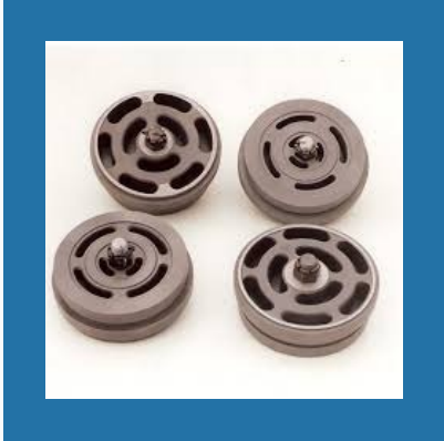
Air Compressor Valves