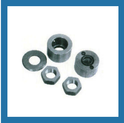
Piston Rings for Khosla & Kirloskar CPT Compressor