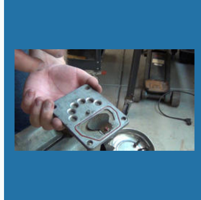
Air Compressor Piston Assembly