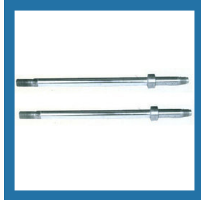
Compressor Piston Rods & Accessories