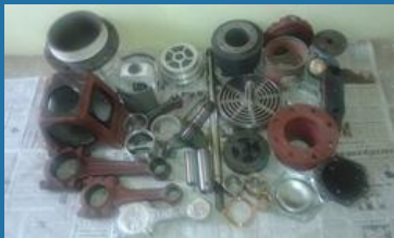
CPT Air Compressor Spare Parts