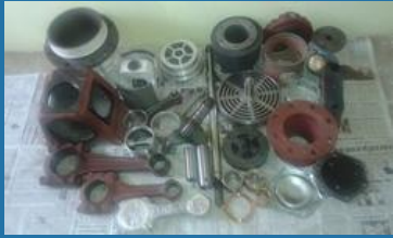
Khosla Air Compressor Spare Parts