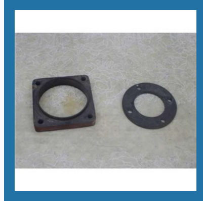
Lubricating Compressor Spare