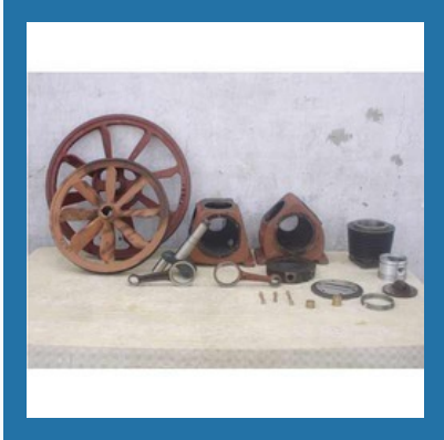
Garage Compressor Parts