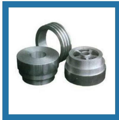
Air Compressor Parts