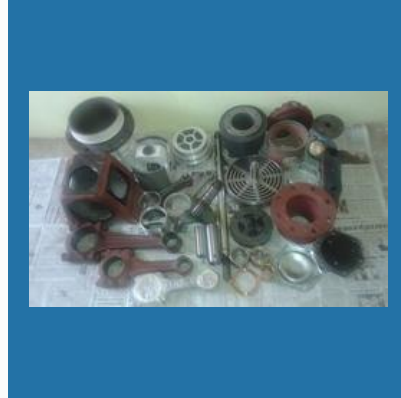
Air Compressor Spare Parts