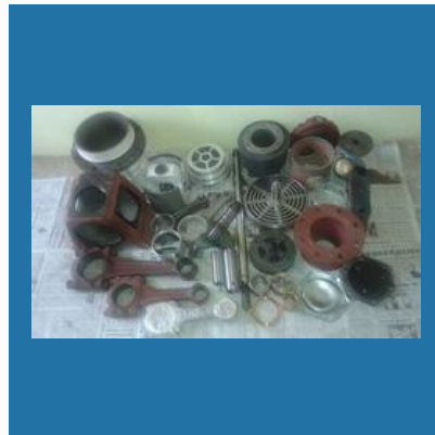
Air Compressor Parts