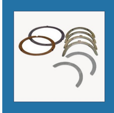
Compressor Thrust Washer