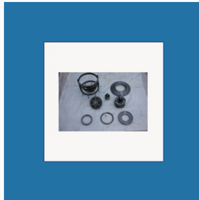
Refrigeration Compressor Parts