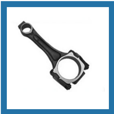
Connecting Rods HA/ HY/ HB