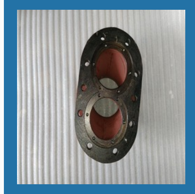
Non Return Valve